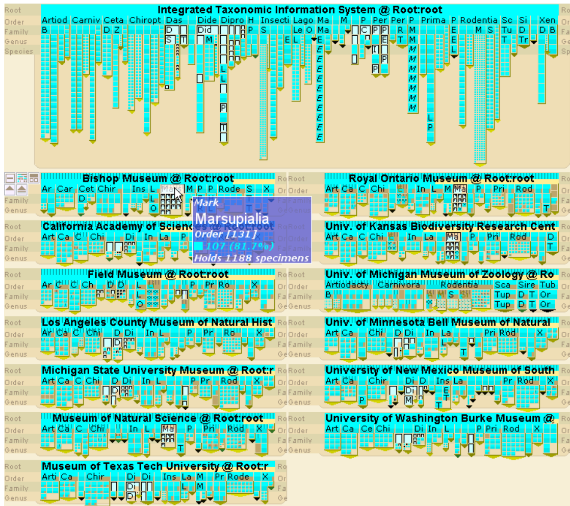
Figure 3. ITIS reference taxonomy distribution across collections.

Australasia, has not been included in the ITIS taxonomy. This indicates that several collections have decided that they have enough material in Marsupialia that following the ITIS taxonomy is no longer appropriate.